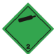
2.2 : Non-flammable, non-toxic gases